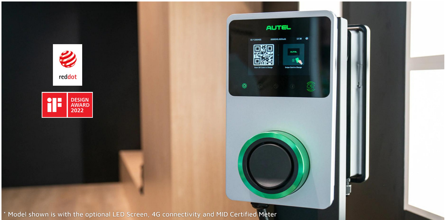
* Model shown is with the optional LED Screen, 4G connectivity and MID Certified Meter